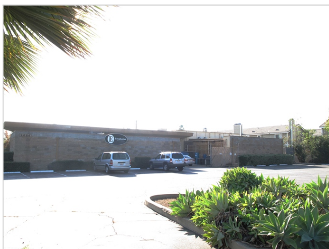
2666 Huntington Dr