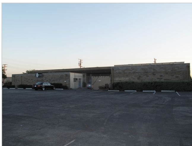
2666 Huntington Dr