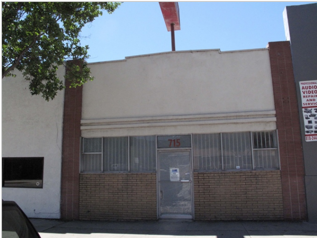
715 S. Victory Blvd