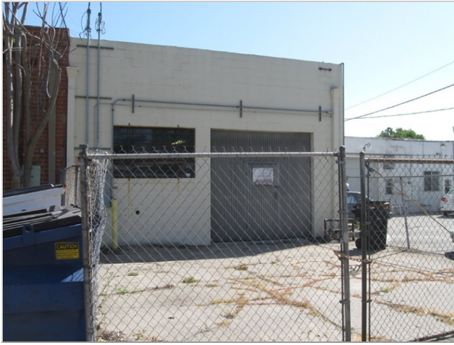
715 S. Victory Blvd