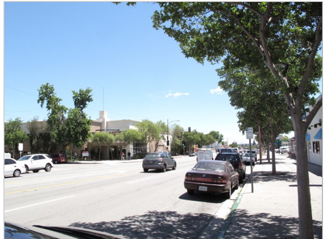
715 S. Victory Blvd