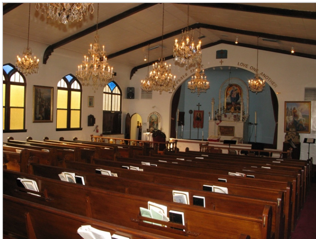
East Los Angeles Church