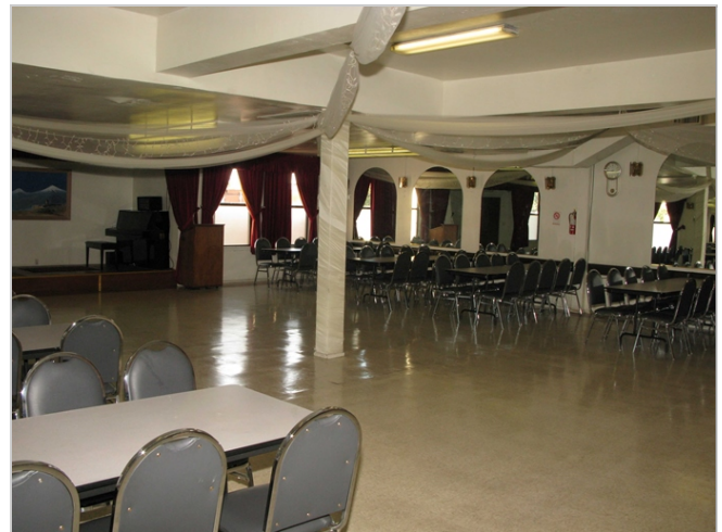
East Los Angeles Church