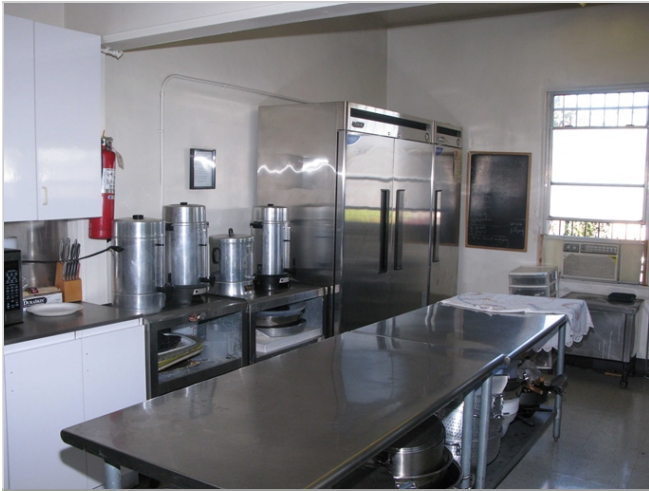
East Los Angeles Church