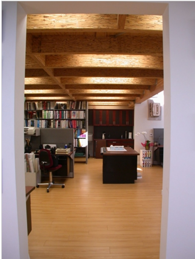
Stunning Architectural Office Building on Glenoaks