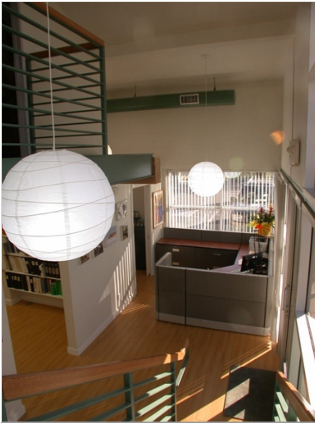
view from stairs